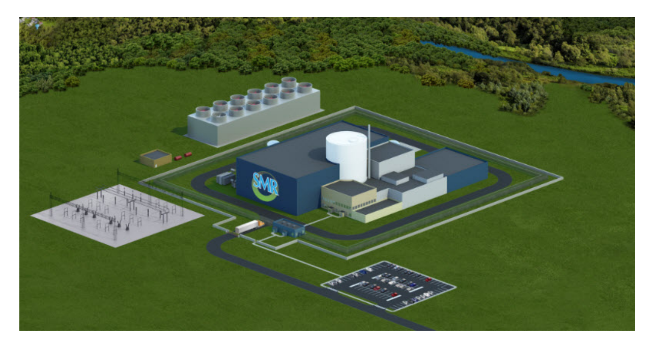
Figure 4. Holtec SMR-160, a 160 MW Electric Nuclear Power Plant [56].