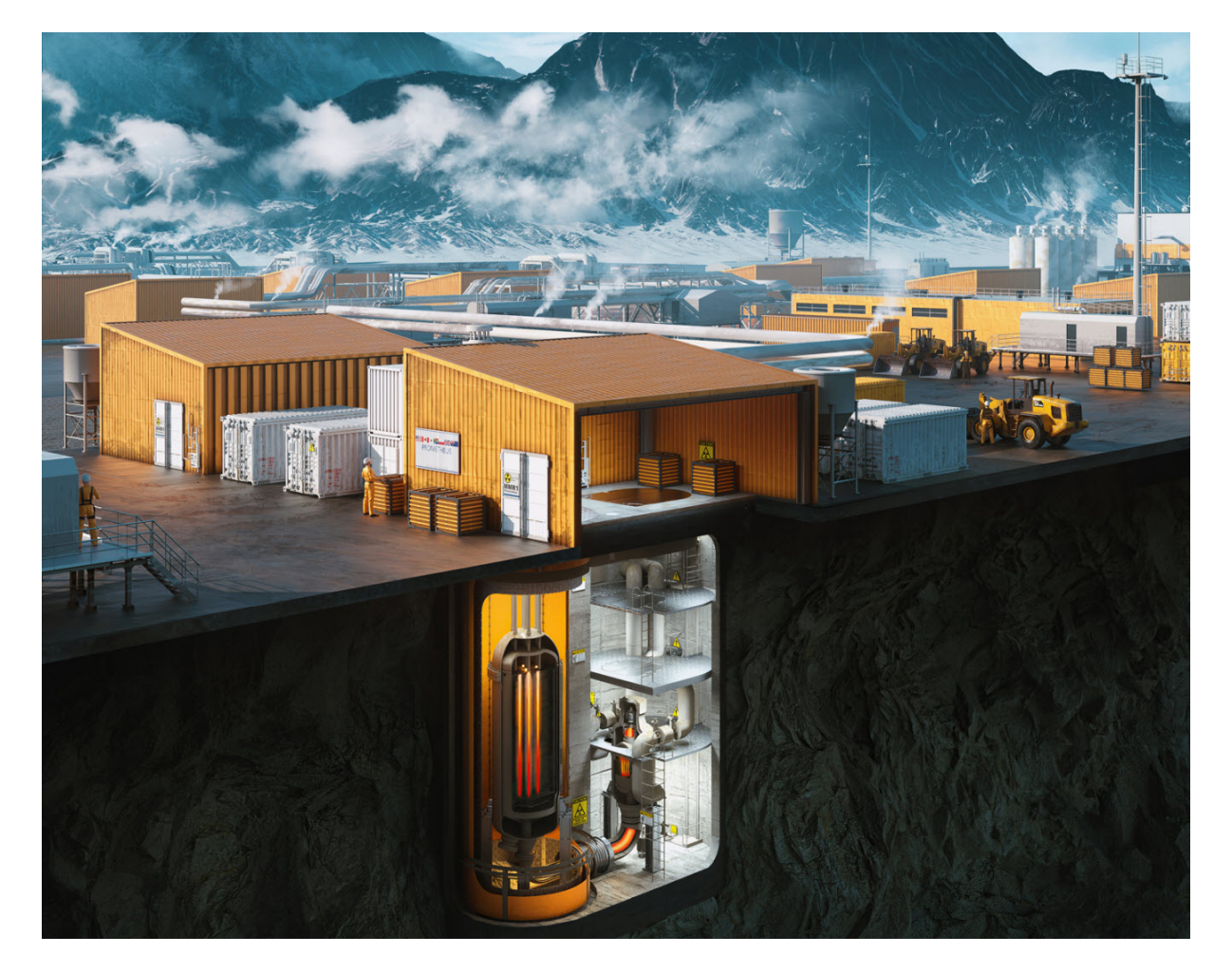
Figure 3. Example of underground placement of SMR [53].

SMRs can find applications in many areas of nuclear energy use. The steady development of SMRs was revealed as a result of the analysis of the current trends in the development of atomic energy. Currently, the most developed type is LWR installations with pressurized water among the existing SMR projects. Steam generators are one of the main elements of them. The preferred design is a functional-flow steam generator with functional body movement in tubes with coiled surfaces [14].