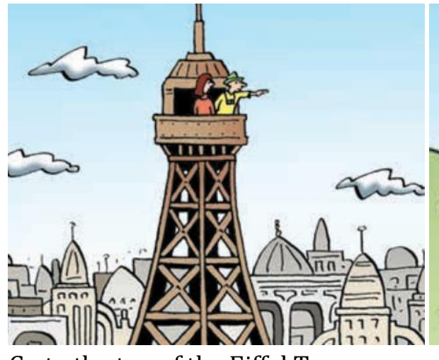
Go to the top of the Eiffel Tower