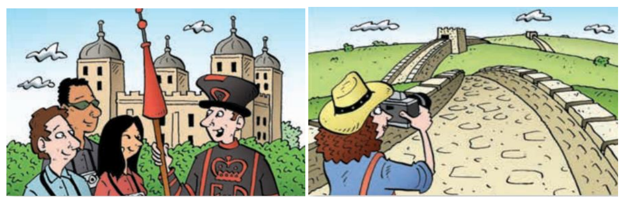
Take a tour of the Tower of London