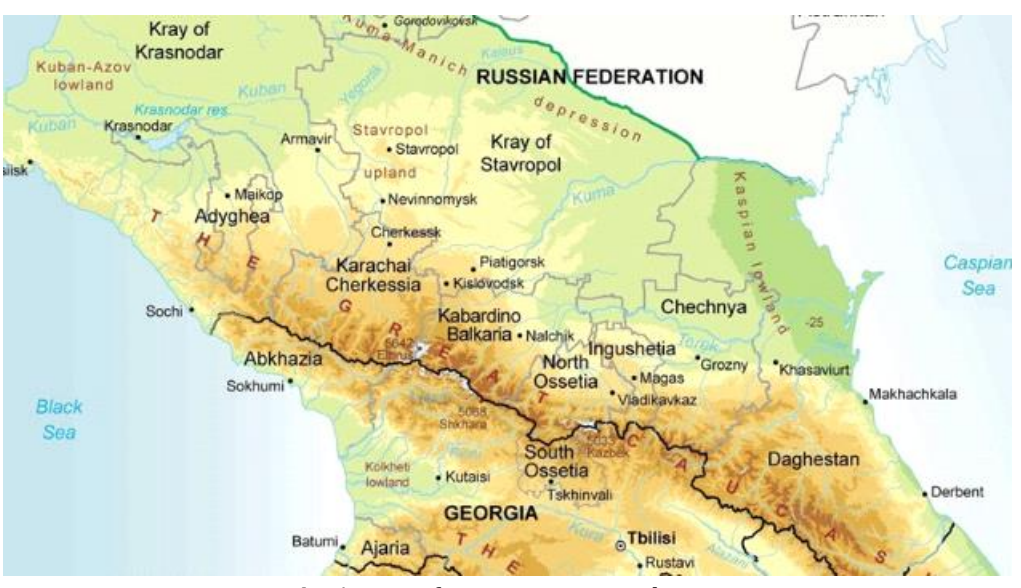
Fig. 1. Map of stationary research sites.

[21-23]. The study area is shown in Figure 1.