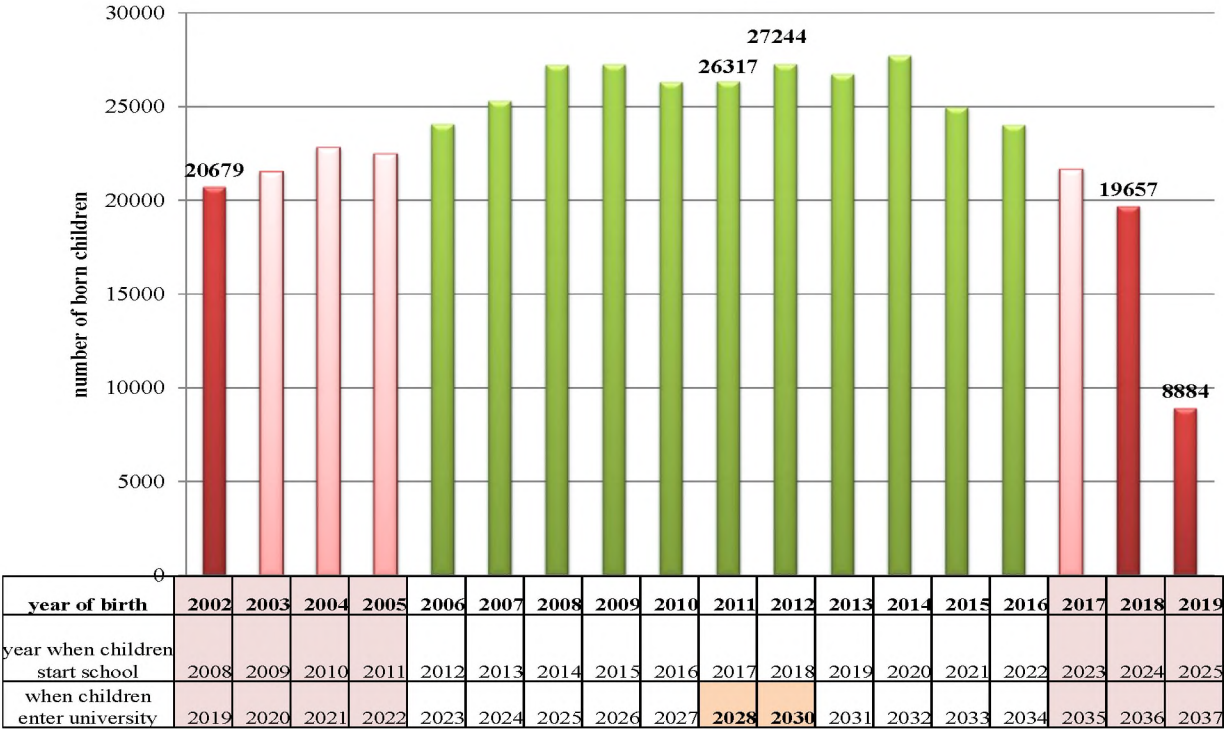
Fig. 1. Demographic situation in Kharkiv region (as of August 2019)

The first window includes 1999-2003, i.e. the years with the lowest birth rates. The lowest figure was in 2001 (19025 children were born) [6, p. 44]. The second window opens in 2017 with the mark of 21631 births. The following year, it dropped below the 2001 mark, reaching 19657 births. However, it should be emphasized that the situation in 2019 is only worsening, and even the published data for half a year (8884 births) suggest that the birth rate continues to fall. These indicators will negatively affect the development of the education system in the region. Namely, if you look at the years with demographic “pitfalls” and determine the years when children will go to secondary school and then enter higher education institutions, one can predict that the consequence of the first window will be the lowest number of secondary school graduates, who can enter higher education institutions, expected from 2019 to 2022, and as a result of the second window, both secondary schools (from 2023) and the higher education institutions (from 2035) will experience a shortfall. In addition, since 2018 12-year secondary education has been implemented in Ukraine. This means that secondary school will not have graduates in 2029 and, accordingly, the higher education institutions will not be able to have the necessary admission, even by government order.